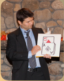
You make magic happen!