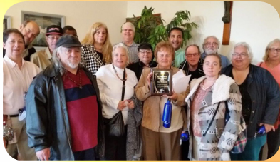
Thanks to you, we are #1!